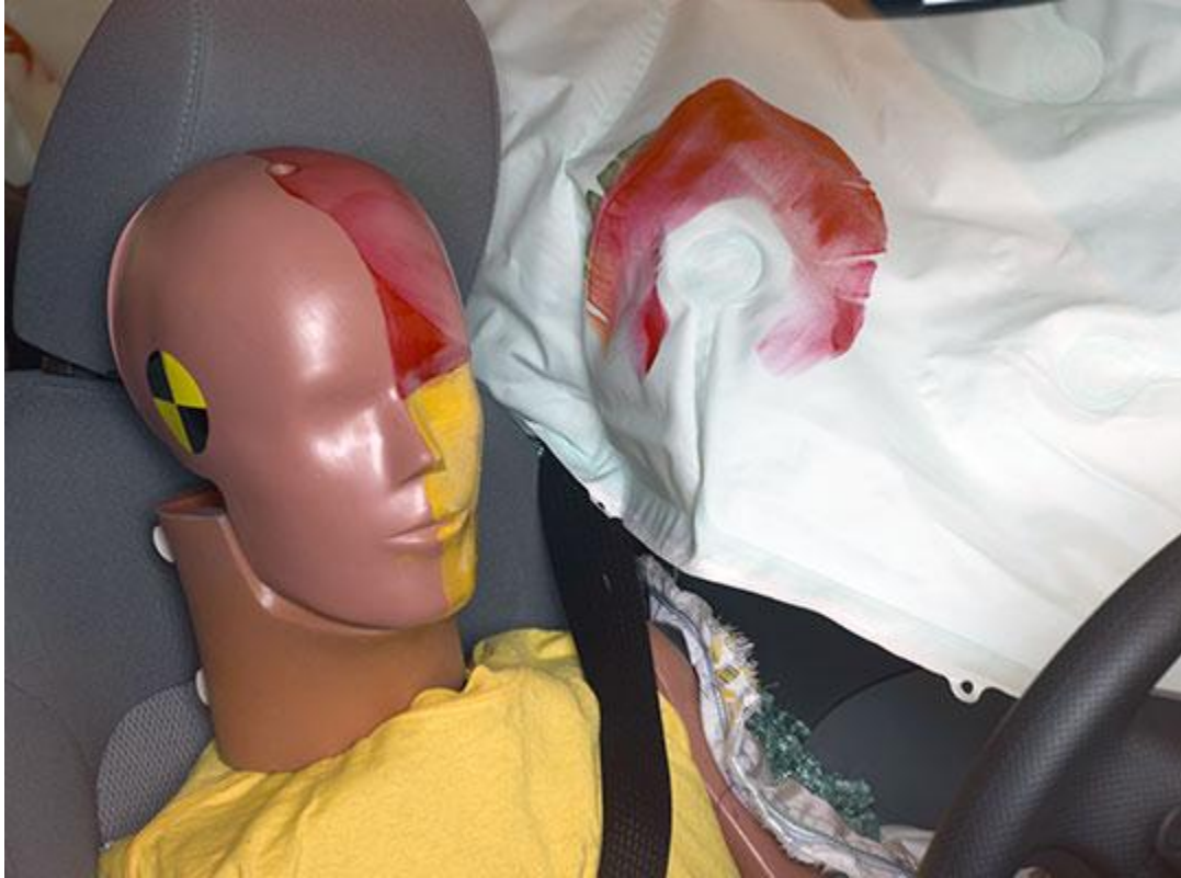
Smearred greasepaint shows where the driver dummy's head hit the side curtain airbag.

Head protection: To supplement head injury measures, technicians put greasepaint on the dummies' heads before each crash test. After the test, the paint shows what parts of the vehicle or the barrier came into contact with the heads. If the vehicle has airbags and they perform correctly, the paint should end up on them.